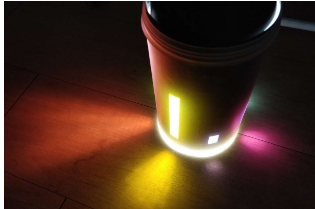
Data diary created by Shashank Jain in Fall 2019 that shows the time he spent on various activities in a week

The Moth story exercise and other short assignments (5% of final grade): Analyzing examples of storytelling can help us learn how to recognize narrative elements and opportunities to integrate narrative in our own work. In this short assignment, you'll analyze several short